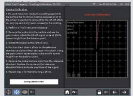
Calibrate for Paint Layer